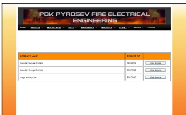
Figure 3: Code of view invoice sales

View invoice function is where latest invoice can be view accordingly.