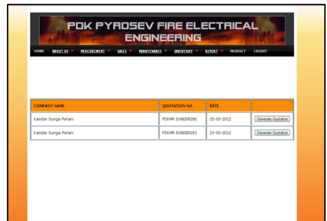
Figure 1: Code of view quotation

Many system interfaces will be implemented and also the related coding. The main interfaces of web based application basically come with 4 module which are procurement module, sales module, maintenance module, and inventory module to run different task separately. The implementation and coding of the PDK Fire Fighting Management system will be described by each function interfaces.