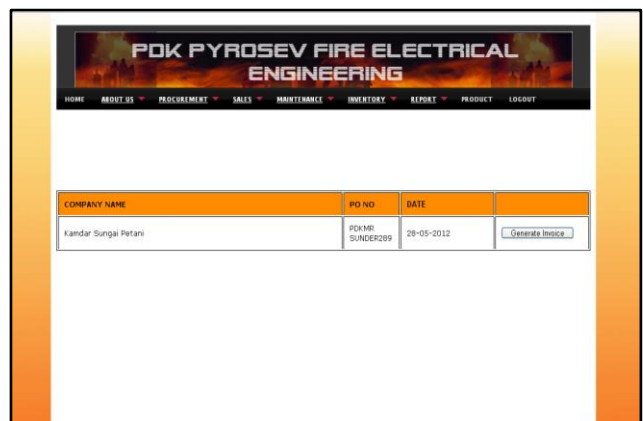
Figure 2: Code of view new purchase order

View invoice function is where latest invoice can be view accordingly.